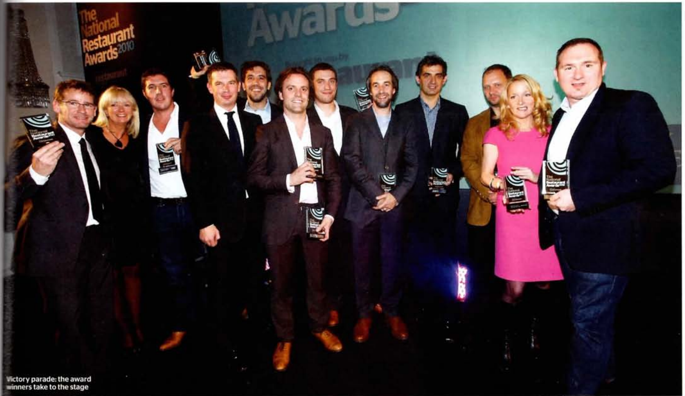
Victory parade: the award winners take to the stage

The list also reflects two further factors: the ever-increasing quality of restaurants around the regions of the UK, and a plethora of brilliant new additions to the eating-out sector in the last year.