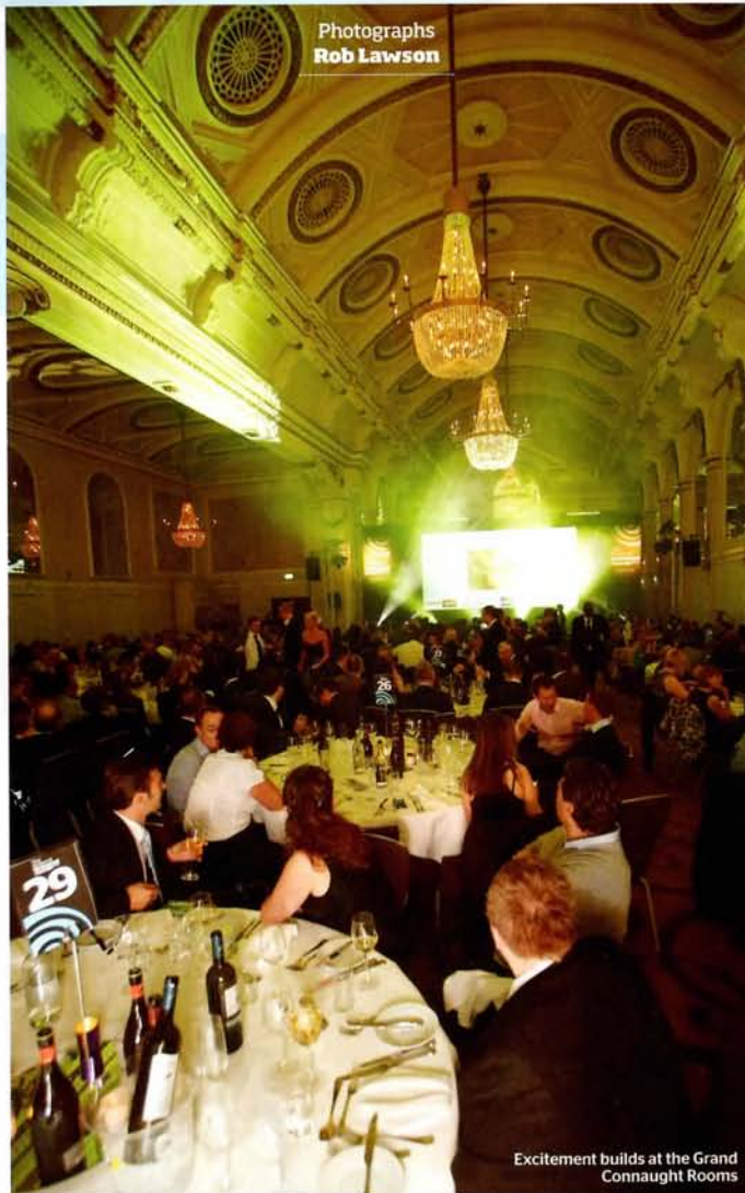
Photographs Rob Lawson