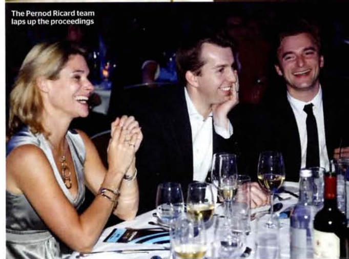
The Pernod Ricard team laps up the proceedings