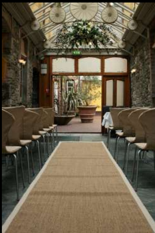
80 West Street

You can even book the entire hotel, for the whole day, with no room hire fee or additional costs, and rooms reserved for your wedding guests at preferential rates.